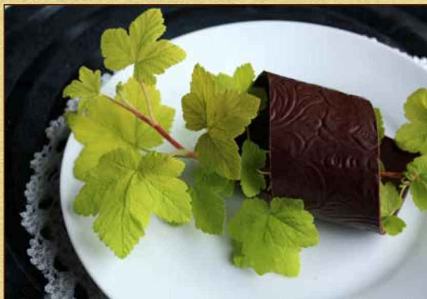
{ CHOCOLATE NAPKIN HOLDERS: Available in White, Milk or Dark Chocolate }