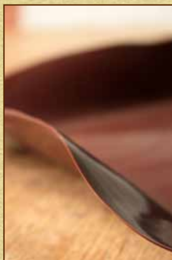
{ TABLE ACCENTS: Available in White, Milk or Dark Chocolate }